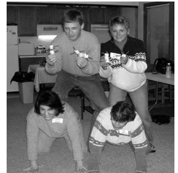
We're not sure what it is, but they were very proud of their creation!

Special thanks to Comtrak for sponsoring the orientation dinner at DaVinci's.